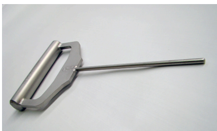
The BFM® 'TR Release Tool'.

The BFM® TR (tool release) O40E and O40AS fittings have an embossed identifier stamp to make them easy to differentiate from our standard fittings.